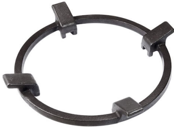
Cast iron wok support 9601 727